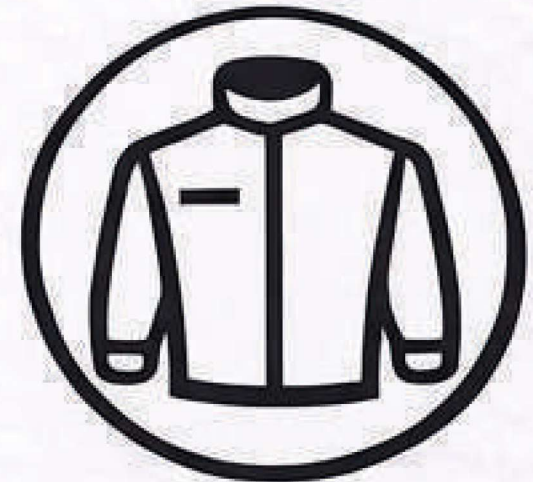
EN ISO 13688

Standard for flame-resistant garments protecting workers against flash fire.