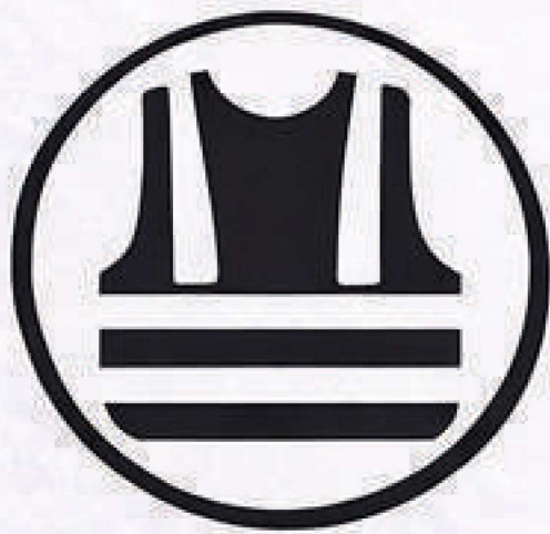
EN ISO 20471

Provides electrostatic dissipative properties to prevent static discharge.