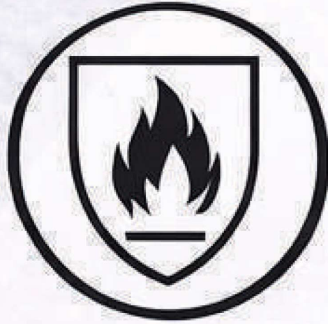
EN ISO 11612

Protective clothing against heat and flame hazards for industrial environments.